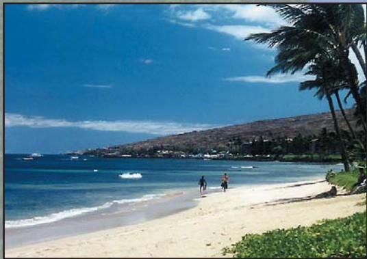
Miles of Sandy Beaches!