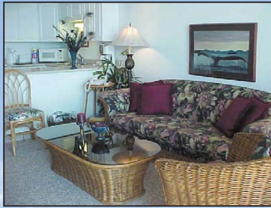
One Bedroom/One Bath Condo