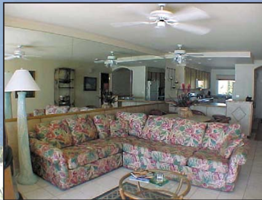
Two Bedroom/Two Bath Condo