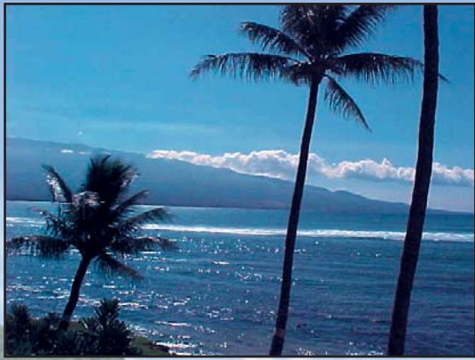
View from a Lanai